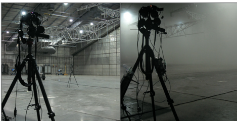
Fog and environmental testing