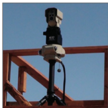
Ground Station Mount